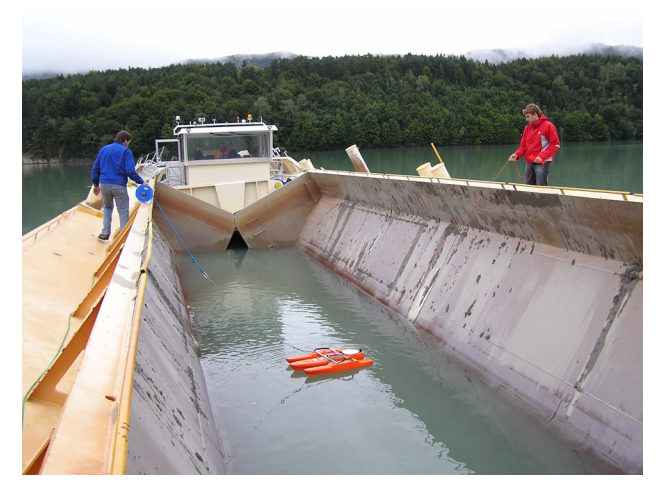
Figure 1: ADCP measurements with bottom-dump barge

used to adjust the characteristics of the transmission pulse and is set based on the maximum apparent velocity (ADCP motion plus water speed). The lower the value of WV, the lower the single-ping standard deviation. The WV-value was set to 100 cm/s (minimum) for all measurement points according to the 1-D numerical calculations and the predicted ADCP device motion. The BX-command sets the maximum tracking depth used by the ADCP during bottom tracking. This prevents the ADCP from searching too long and too deep for the bottom, allowing a faster ping rate when the ADCP loses track of the bottom. The BX-value was determined based on available echo sounder surveys and adjusted for every measurement point. The default depth cell size (WS-command) of 25 cm was increased according to the water depth to account for the maximal recommended number of depth cells (60 in Water Mode 12) and therefore to achieve high sampling rates.